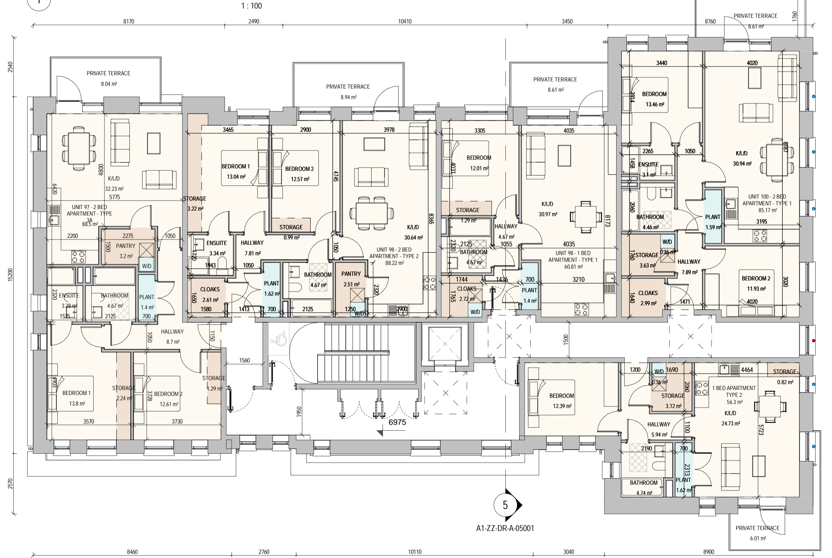
3 Second Floor Plan